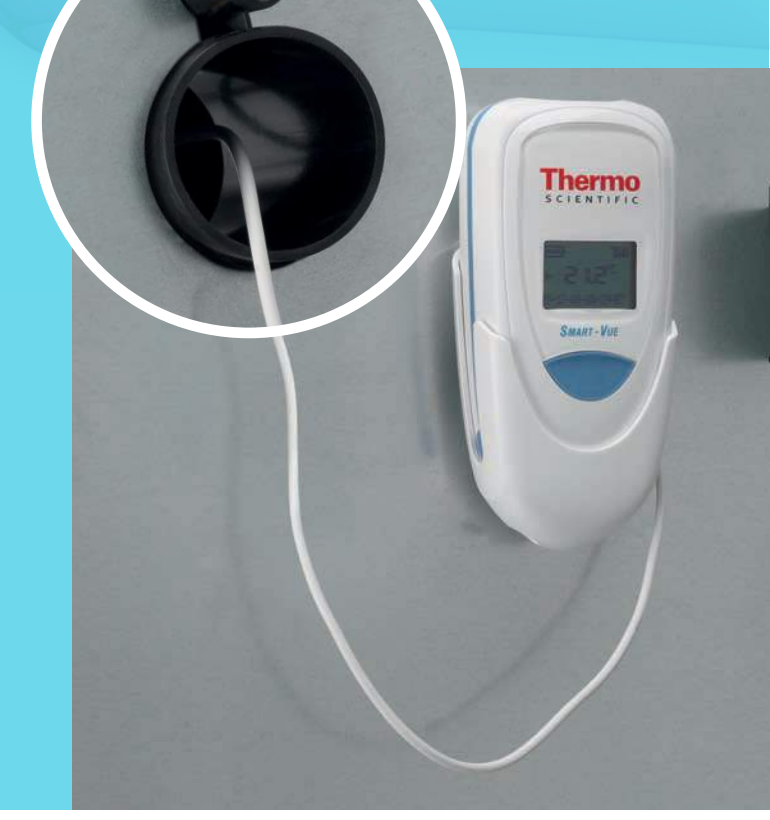
Rear view of the 100 L Advanced Protocol incubator with Smart-Vue

Solutions vary by RF regions worldwide and are compatible with multiple brands and types of laboratory equipment. Contact your local sales representative for more details.