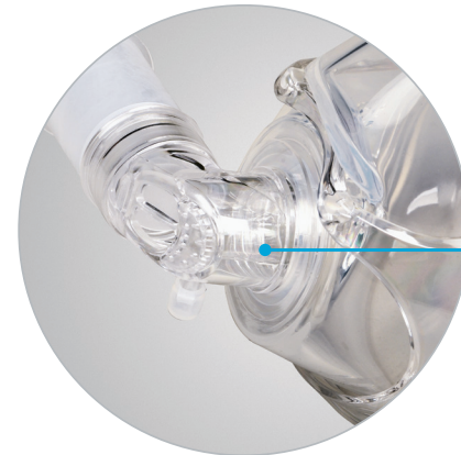
Mask not flexed