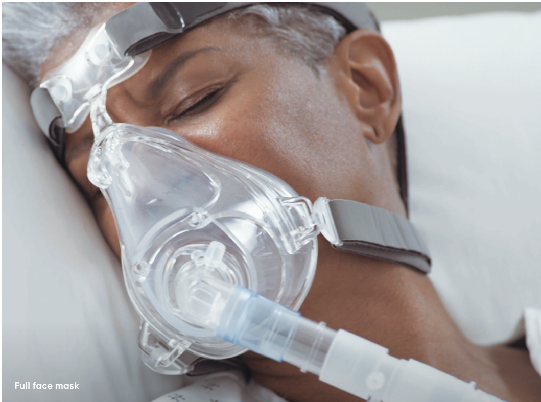
Full face mask