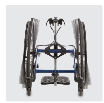
Standard camber angle: Size 1: 8^\circ , Size 2: 6^\circ , Size 3: 6^\circ , Size 4: 4^\circ Available to choose standard plus: +3^\circ , +6^\circ , -3^\circ , -6^\circ