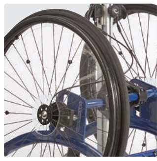
Closed push rims