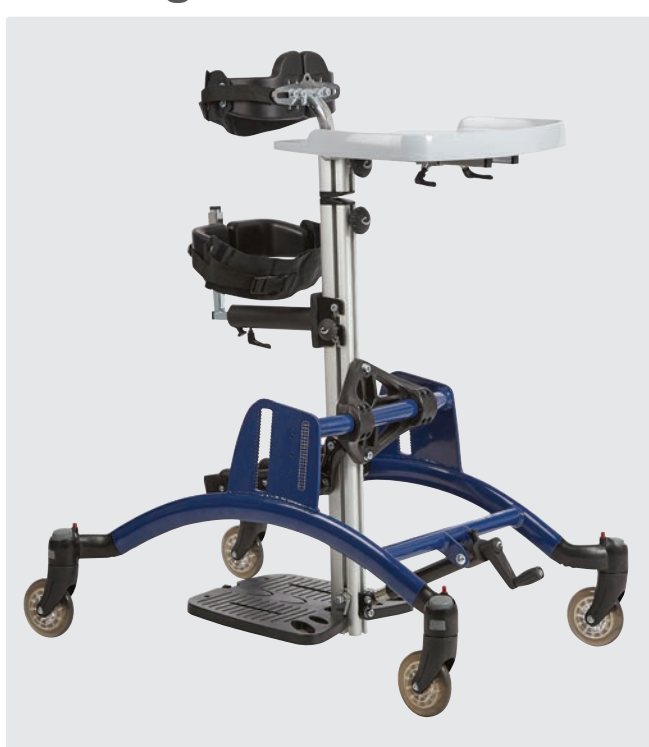
No driving wheels, 4 castors with brakes Prepared for driving wheels, 4 castors with brakes