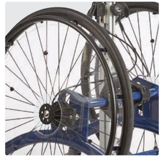
Open push rims