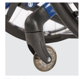
Without brakes (driving wheels must be fitted)