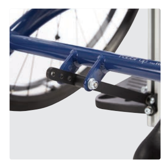
CHOOSE ANGLE ADJUSTMENT