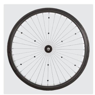
Available in 22", 24", 26", 29", 32", 36"