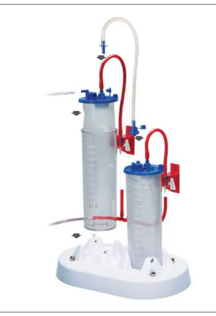
Two-canister floor stand assembly

This is a two-canister floor stand assembly. The stand is mounted on casters for ease of movement.