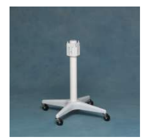
51 cm Roll stand