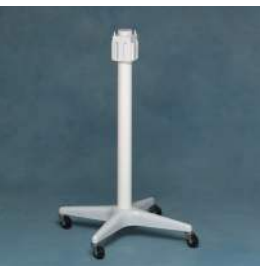
76 cm Roll stand

Roll stands allow flexibility in the location and configuration of Medi-Vac™ Canister (CRD™, Flex Advantage™ Liners or Guardian™ Systems) installations.