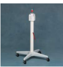
76 cm Roll stand with regulator mount