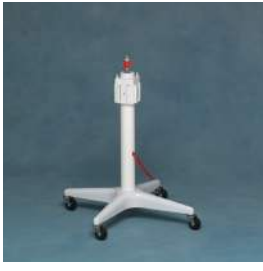
51 cm Roll stand with regulator mount