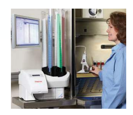
PrintMate AS cassette printer shown with optional all-in-one PC and digital imager.