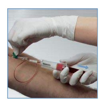
4 Remove the last tube