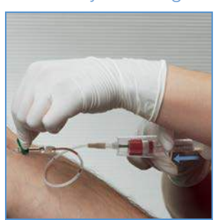
3 Insert the first tube