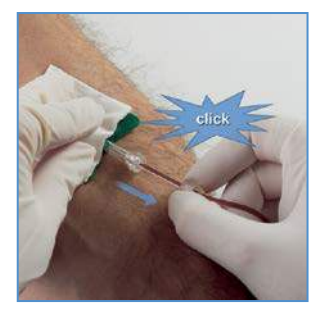
6 Slide safety hub backwards until an audible click is heard