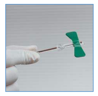
7 The needle will be fully enclosed in the protective shield