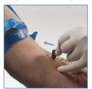
2 Perform Venepuncture