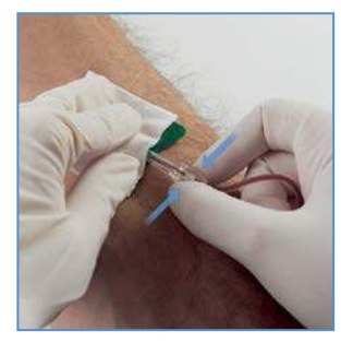
5 After securing the butterfly wings, press in both buttons of safety hub