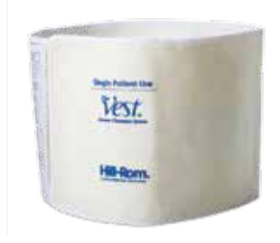
Single Patient Use "Wrap (Slotted) Style" Vests Frontal bladder. Placed under arms around patient's torso.